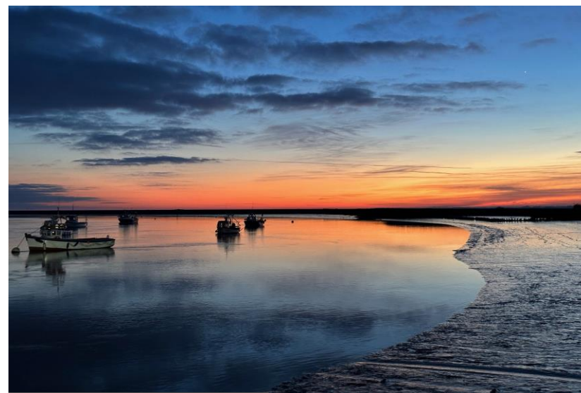
Orford Quay at Sunset

IMPORTANT: we would like to inform prospective purchasers that these sales particulars have been prepared as a general guide only. A detailed survey has not been carried out, nor the services, appliances and fittings tested. Room sizes should not be relied upon for furnishing purposes and are approximate. If floor plans are included, they are for guidance only and illustration purposes only and may not be to scale. If there are any important matters likely to affect your decision to buy, please contact us before viewing the property.